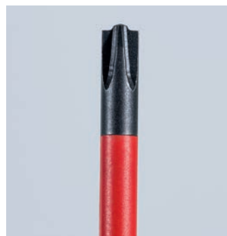
98 24 02 SLS: Phillips®/slotted