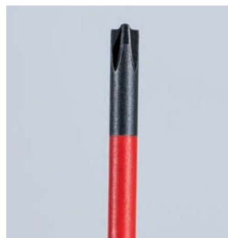
98 24 01 SLS: Phillips®/slotted