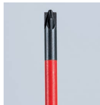
98 25 01 SLS: Pozidriv®/slotted