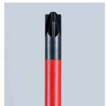
98 25 02 SLS: Pozidriv®/slotted